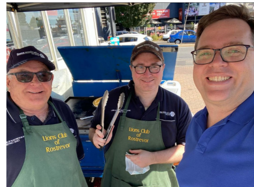
Supporting the work of the Rostrevor Lions Club