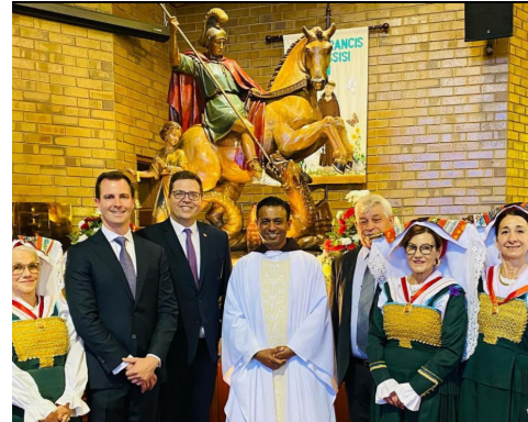
San Giorgio Martire Festa at St Francis of Assisi Church, Newton.