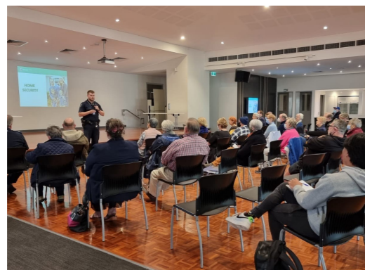
The recent Crime Prevention and Safety forum I hosted in conjunction with Campbelltown Council.