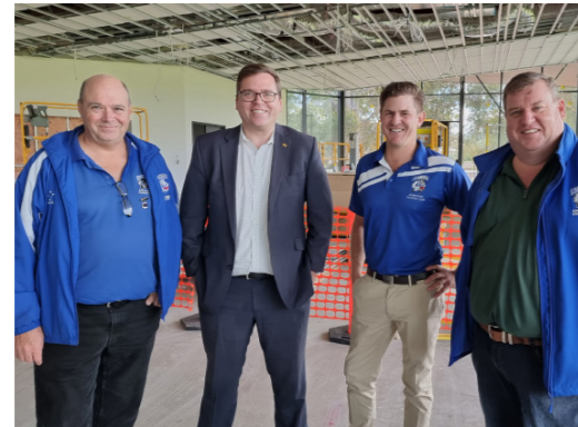
Work nears completion on the new Athelstone Football Club rooms!