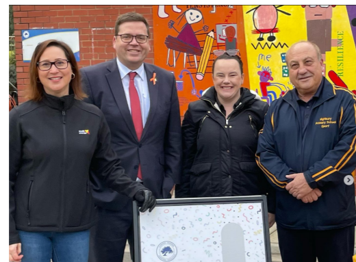
Highbury Primary School 50th Anniversary Celebrations