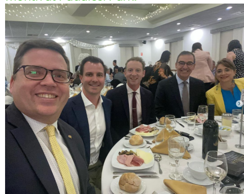
With the Liberal team at the Radio Italiana Uno fundraiser for Ukrainian refugees