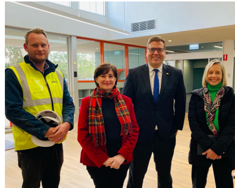
Checking out the new facilities at Stradbroke Primary School thanks to its $7 million upgrade.