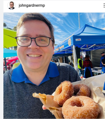
johngardnermp Popular with my kids at the Magill Sunrise Rotary markets this morning!

Follow @JohnGardnerMP on Facebook, Instagram, Twitter or YouTube if you'd like to check out what I'm up to.