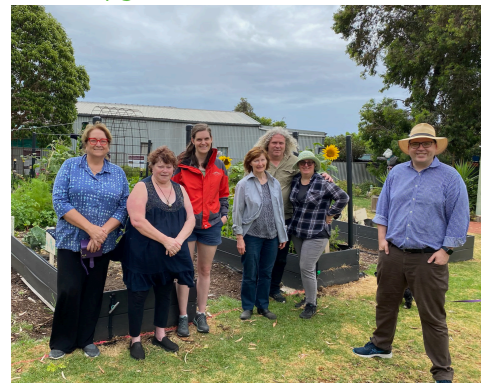
Athelstone Community Garden open garden - first and third Saturday of every month at Padulesi Park.