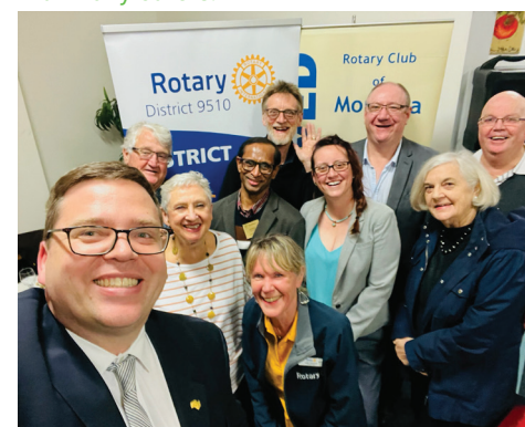
Like all our local service clubs, Morialta Rotary Club are a welcoming and passionate group of volunteers who get things done!