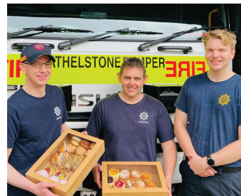
Visited Athelstone CFS the morning after the storms with some Fine Food Cucina treats to thank them for working through the nights cleaning up storm damage in our area, along with many others.