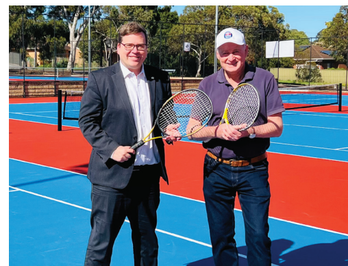
Great to see the new courts at Rostrevor Tennis Club, thanks to massive fundraising efforts by club volunteers and assisted by a $48,000 grant from the former Government.