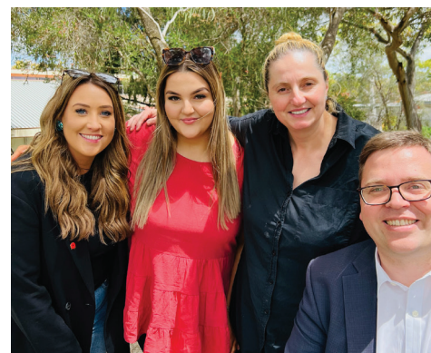
Happy 50th birthday to Highbury Primary School. A beautiful day for the 50th birthday fair, with great attendance from around the community!