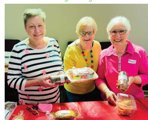
Mighty Magill Christmas Market at Morialta Uniting Church. All the home-made Christmas cake in the land!