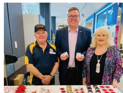
Tea Tree Gully RSL poppy pin sales ahead of Remembrance Day.