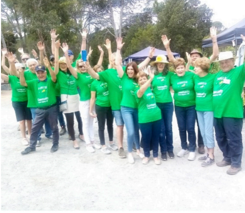
johngardnermp Thanks and congratulations to all the committee and volunteers at the Pioneer Court Community Garden, Highbury for putting on such a lovely open day! #Morialta @pioneercommunity